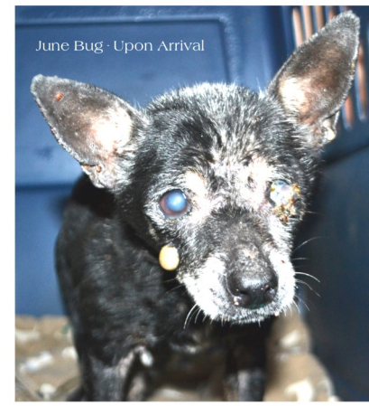
June Bug - Upon Arrival